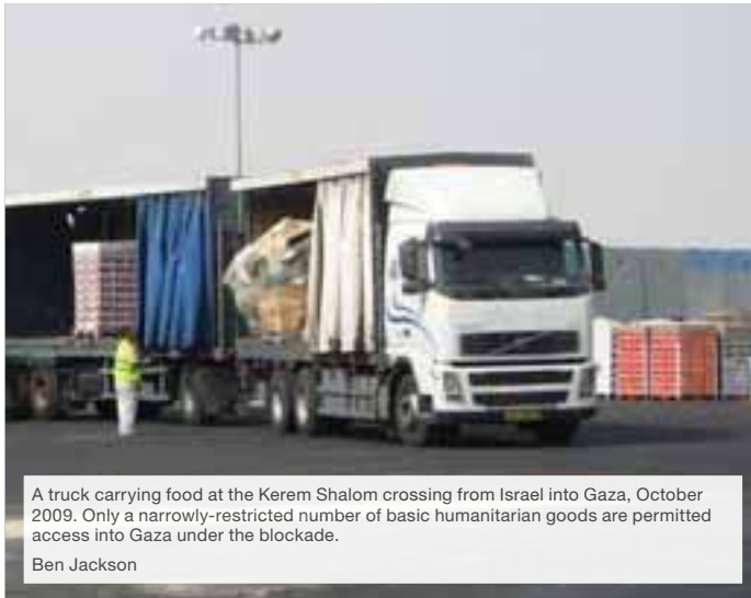
A truck carrying food at the Kerem Shalom crossing from Israel into Gaza, October 2009. Only a narrowly-restricted number of basic humanitarian goods are permitted access into Gaza under the blockade.