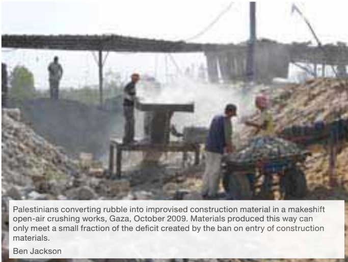
Palestinians converting rubble into improvised construction material in a makeshift open-air crushing works, Gaza, October 2009. Materials produced this way can only meet a small fraction of the deficit created by the ban on entry of construction materials.