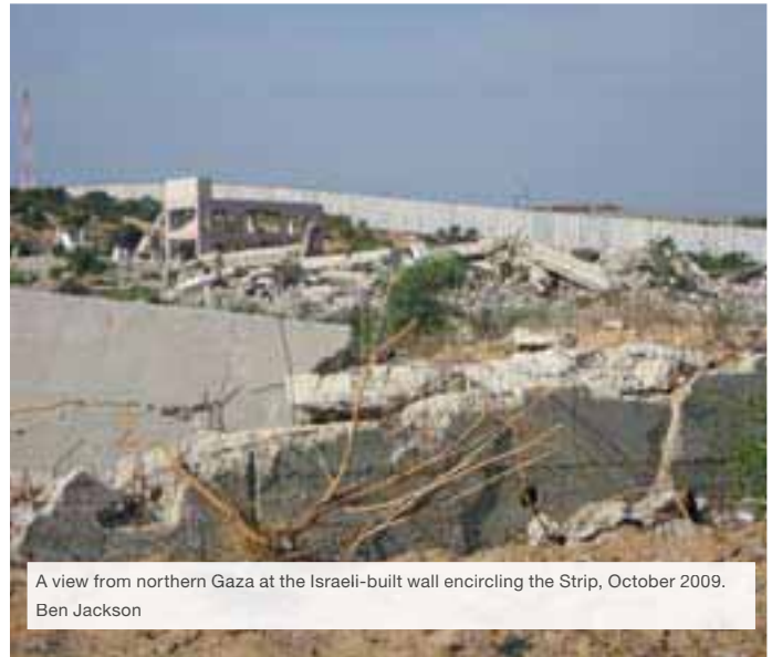
A view from northern Gaza at the Israeli-built wall encircling the Strip, October 2009. Ben Jackson

While Israel has a duty to protect its citizens, the measures it uses to do so must conform to international humanitarian and human rights law. Indiscriminate attacks by Palestinian armed groups in southern Israel, which have killed several civilians and injured dozens more, are a clear violation of international humanitarian law. We condemn such indiscriminate attacks against civilians. Abuses of international law by one side, no matter how serious, can never justify abuses by the other side. By enforcing the blockade on the Gaza Strip, Israel is violating the absolute prohibition on collective punishment in international humanitarian law, 67 punishing the entire population of Gaza for the acts of a few.