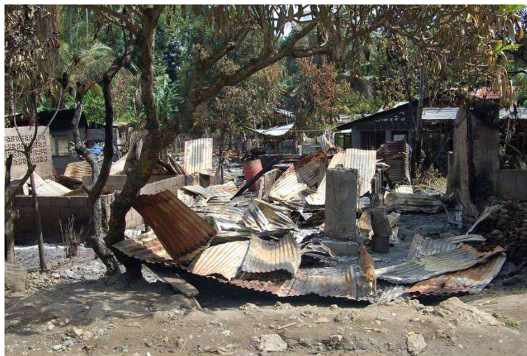
Figure 19: Remains of a burned school in Lanao del Norte province