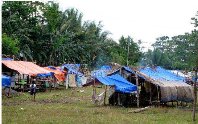
Figure 7: A “tent city” style IDP site in Pikit, North Cotabato

Amnesty International visited some of the temporary shelters including a church-owned gymnasium, a rice warehouse, and various “tent cities”. “Tent cities” are informal structures where displaced people use donated tarpaulin tents for shelter. They augment these materials with dried coconut palm leaves or ripped up sacks of rice. On a typically rainy day during the monsoon season, displaced people have to contend with the muddy ground that is also their floor and sleeping space.