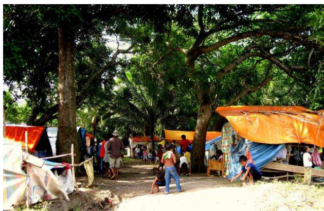
Figure 12: Fatima’s “new home” is one of these tents

“We did not really want to come to Pikit because we had our farm to think about and our crops were ready for harvest. When the military came, we were asked to leave our village. My husband asked for the military’s permission to go back to our farms just to harvest our crops, but they said no. They had to ‘clear’ the area of MILF fighters. Then, that same day, the fighting began and we had to flee to Pikit Poblacion (town centre). Nowadays we just sit here, waiting. Waiting for dole outs from NGOs. Waiting to receive rice, noodles, sardines. We wait for handouts, but our farms are also waiting for us. The copra in our backyard is waiting. The corn, ready to be harvested is also waiting. They wait, we wait. Look at our new home. When it rains, the water seeps in. Last week, my husband had fever. Now, he’s better. He wants to go back and try to harvest our crops so that we do not have to rely on handouts.”