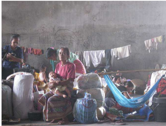
Figure 9: Displaced people in Buisan Evacuation Centre in North Cotabato province

Those that stayed indoors in the rice warehouses or gymnasiums slept on the cement floors, using discarded rice sacks or salvaged blankets for their bedding. Other sites included Islamic schools, mosques, beach resorts, an old municipal building, an old market and a hospital.