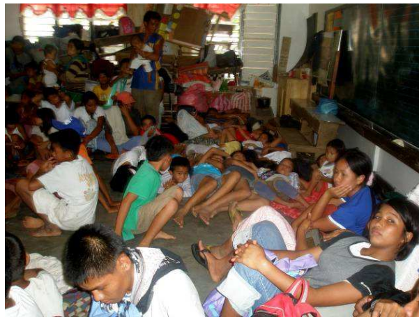
(Used with permission from Bantay Ceasefire, taken August 2008)

Amnesty International observed the conditions in several IDP sites in North Cotabato province, where the largest number of displaced people were in August 2008.