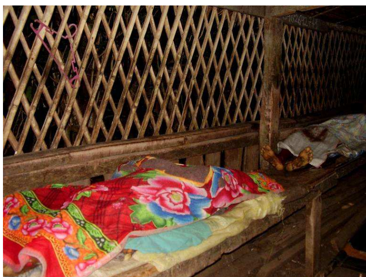
Figure 15: Volunteers recovering the body of Dulcisimo