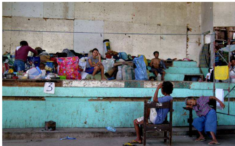
Figure 10: At daytime in many IDP centres, only elderly, women, children are found

In most of the sites visited by Amnesty International, there were midwives and at least one social worker present. Medical care, however was inadequate. There were reports of children dying from diarrhoea in some centres. While on one centre visited by Amnesty International there was a debriefing session conducted by the social workers, other displaced people, especially those staying with relatives, do not receive professional help in processing their often traumatic experiences.