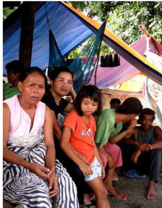
Figure 14: internally displaced persons in North Cotabato province

government to adhere to the UN Guiding Principles for Internal Displacement, including Principle 3(1) which states: “National authorities have the primary duty and responsibility to provide protection and humanitarian assistance to internally displaced persons” and Principle 24 (2) “Humanitarian assistance to internally displaced persons shall not be diverted, in particular for political or military reasons.”